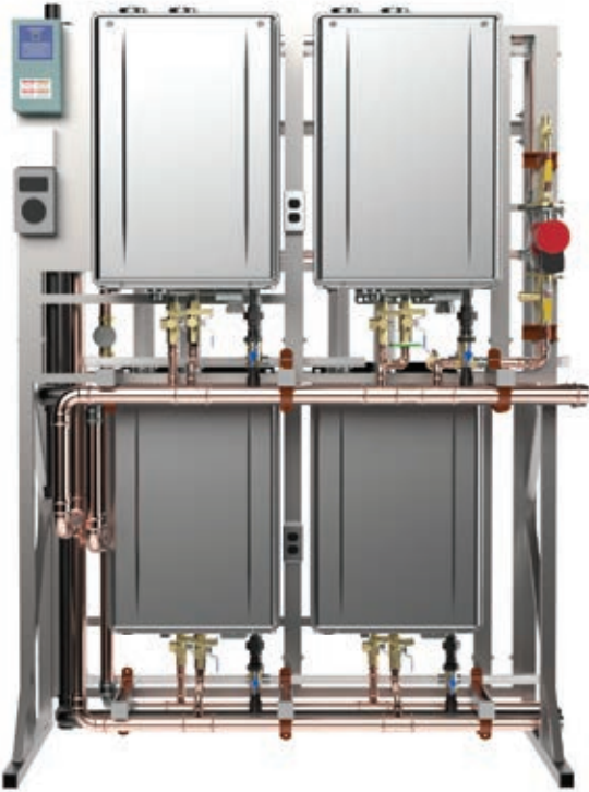
Model Shown: TTS-S4MINI